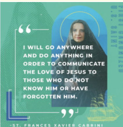
—ST. FRANCES XAVIER CABRINI—

Help me to desire always that which is pleasing and acceptable to You so that your will may be my own.