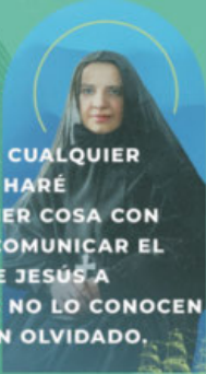
— STA. FRANCISCA JAVIERA CABRINI —

“YO IRÉ A CUALQUIER PARTE Y HARÉ CUALQUIER COSA CON TAL DE COMUNICAR EL AMOR DE JESÚS A QUIENES NO LO CONOCEN O LO HAN OLVIDADO.”