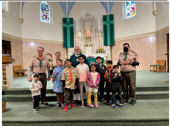
Members of St. John's Troop and Pack 139 observed Scout Sunday at our Inclusive Family Mass on Feb. 5

Matrimony - Arrangements for a wedding should be made at least one year in advance. Please contact one of the priests, 201-384-0101.